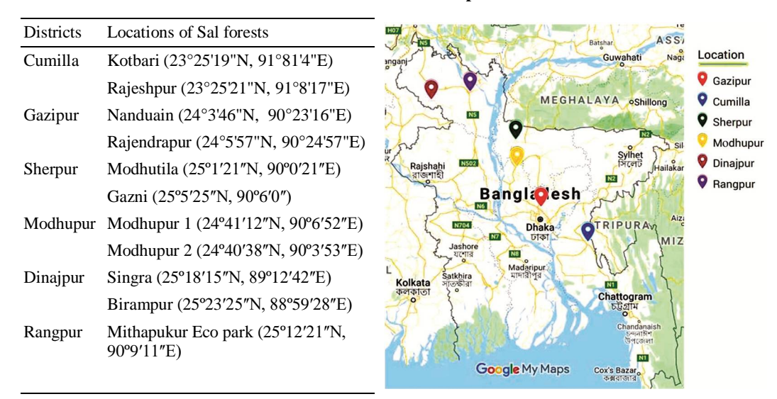
Table 1. Different locations of Sal forests from where the samples were collected.

Naturally grown Sal forests in Cumilla, Gazipur, Sherpur, Modhupur, Dinajpur and Rangpur were selected for soil sampling from the rhizosphere of Sal trees. Twelve soil samples were collected from two layers (upper layer, 0–15 cm and lower layer, 15–30 cm depth) from each sampling sites (Table 1) by following the method of Wu et al. (2016).